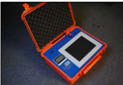
Optional Safety Orange Case