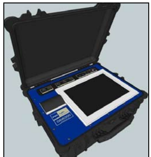
Optional DAW 300 Electronics: Touchscreen PC & Panel Printer in Shock-tested Case