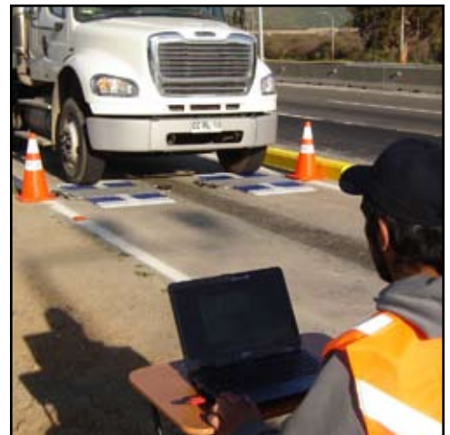
Notebook Computer w. Bluetooth used as Controller