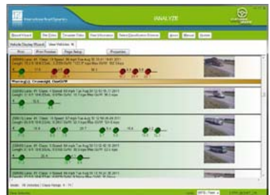
iAnalyze™ 5 View Vehicles screen will display vehicle photographs if available.