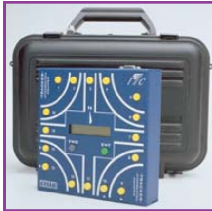
Tracker & Case

The Tracker Intersection Counter has been designed to make intersection turning movement counts easier than ever! The counter has been configured to be comfortably held while viewing and recording traffic. The display is located at the center of the counter enabling all buttons to be accessed easily. Tracking 16 movements through an intersection could not be made easier.