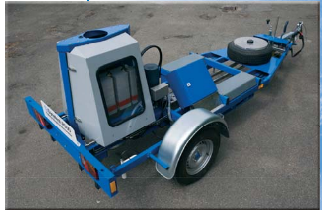
FALLING WEIGHT DEFLECTOMETER

The use of a Dynatest FWD enables the engineer to determine a deflection basin caused by a controlled load with accuracy and resolution superior to other existing test methods. The FWD produces a dynamic impulse load that simulates a moving wheel load, rather than a static, semi-static or vibratory load. These developments allow the use of mechanistic approaches to analyse FWD data.