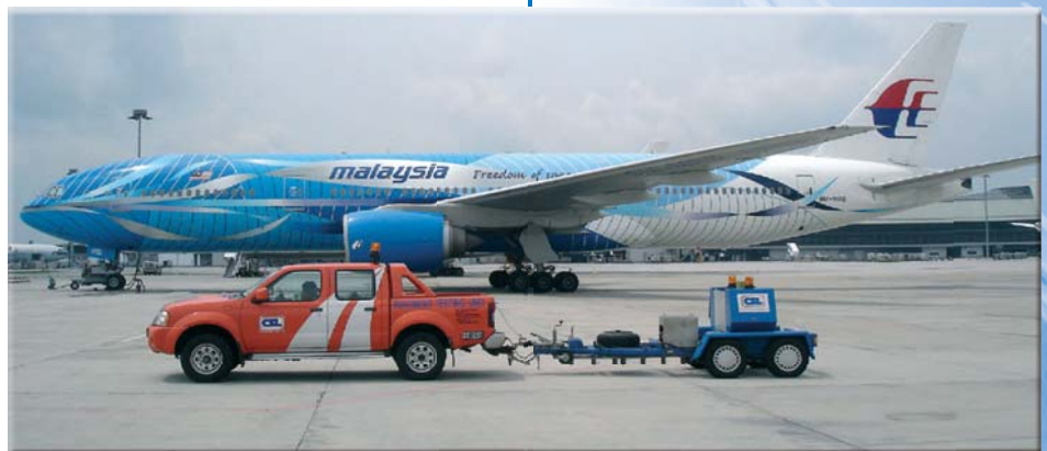
HEAVY WEIGHT DEFLECTOMETER

Dynatest was also the first to introduce a heavier loading FWD, the Dynatest Model 8081 HWD. With an expanded loading range, simulating heavy aircraft such as the Boeing 747 (one wheel), the HWD can properly introduce anticipated load/deflection measurements on even heavy pavements such as airfields and very thick highway pavements. The wider loading range also provides the consultant with a load/ deflection instrument appropriate for both roads and airfields as required.